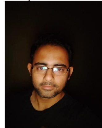
with Spectacles X