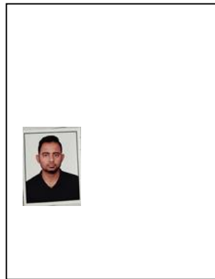
Too Small X