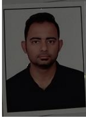
Too Dark X