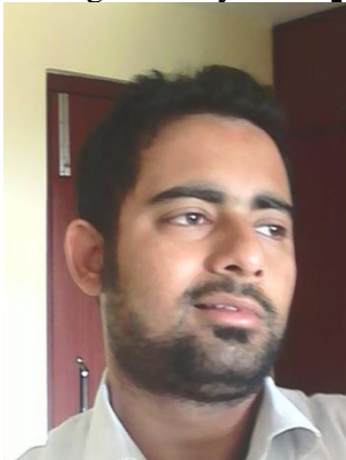
Facing Sideways X