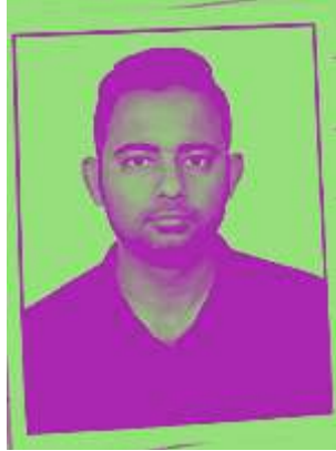
Too much Extra Color X