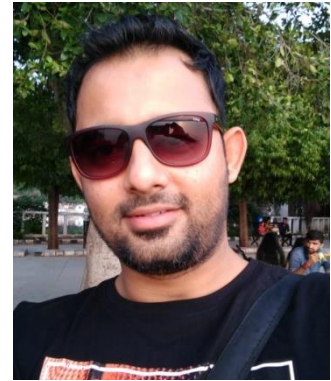
With Goggles X