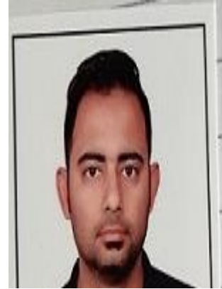
Too Close X