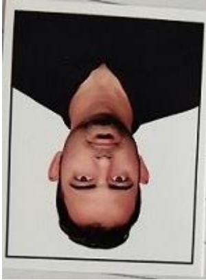
Inverse Photo X